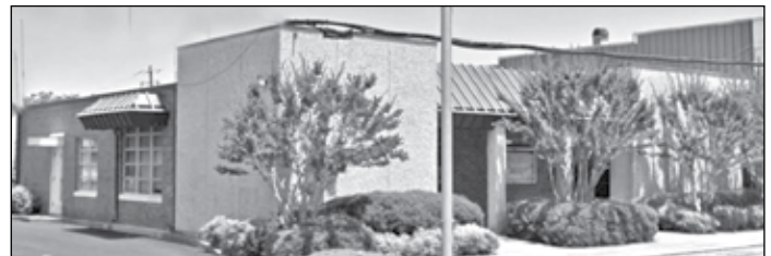
The cramped and obsolete Montevallo City Hall as it looked just prior to its demolition to make way for the newer, more functional building that took its place in 2015.

March 6, 1960, when the Montevallo Volunteer Fire Department held an Open House to celebrate the delivery of its new white Ford fire truck. The fire station and emergency siren at that time was located at the city hall building and adjacent to Montevallo Motor Co. The city's only firefighting equipment until then had been the vintage 1938 Peter Pirsch-built fire truck on a Chevrolet chassis which today's fire department in 2023 still owns and keeps running for use on special occasions.