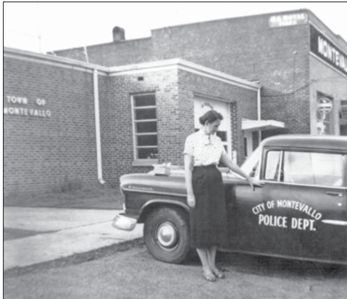
In the mid-1950's, a single patrol car seemed to get the job done for the town's two-man police department.

The photo (above right) was taken on Sunday,