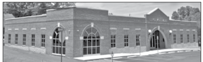
The handsome new City Hall as it looks today brought a much needed expansion for conducting city business. Parking and access is much more generous while the council chamber and offices have created a more practical and professional atmosphere.

Veterans Wreaths will be laid this year at Montevallo City Cemetery on December 16, 2023. Order your wreaths now for $17 each at WWW.HISTORICMONTEVALLO.ORG