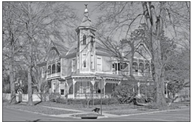
The McKibbon house (still there on E. Boundary) is quite similar architecturally to the Victorian that was on Main Street.

Veterans Wreaths will be laid this year at Montevallo City Cemetery on December 16, 2023. Order your wreaths now for $17 each at WWW.HISTORICMONTEVALLO.ORG