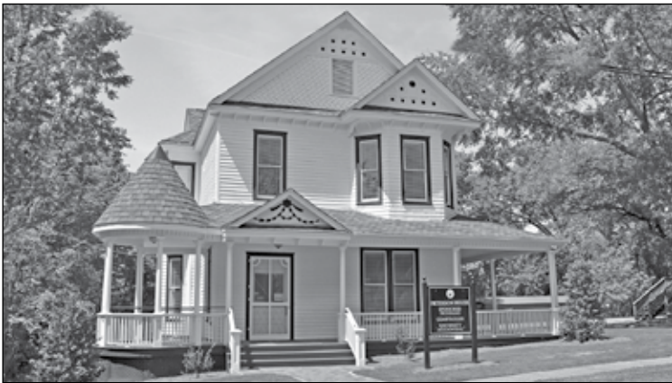
The University of Montevallo now uses the restored "Queen Anne" style Peterson House on Middle Street for Administrative offices.