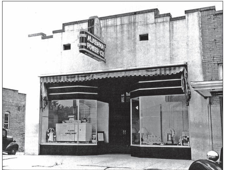
The store building on the northeast corner of the Main Street / Shelby Street intersection was home to the Montevallo District office of Alabama Power Co. for several decades in the mid-twentieth century.